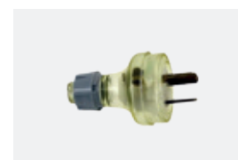
Pump connection kit