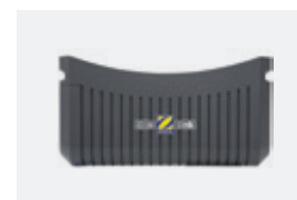
Dual Link module