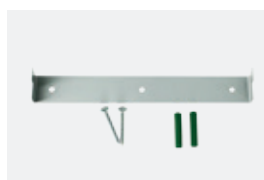
Wall mounting kit