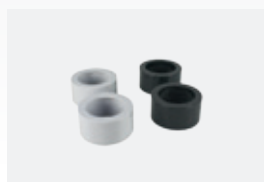
Glued reducer kit