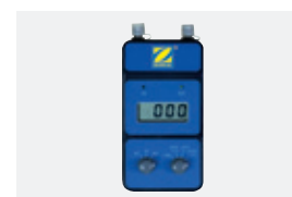
pH sensor testers - Redox

Salt chlorinators are an automatic and efficient disinfection solution. They are easy to use , offer complete water treatment and reduce maintenance .