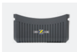
pH Link module