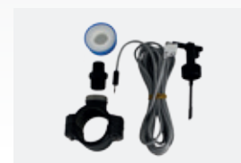
Flow detector kit